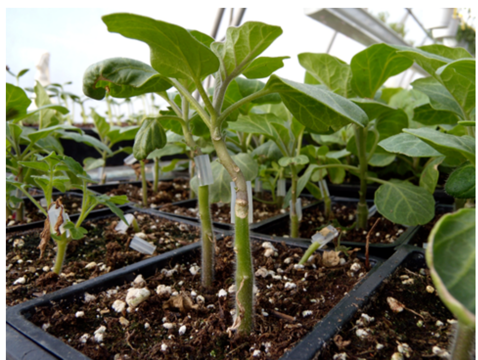
Figure 1. Eggplant grafted on Maxifort rootstock.